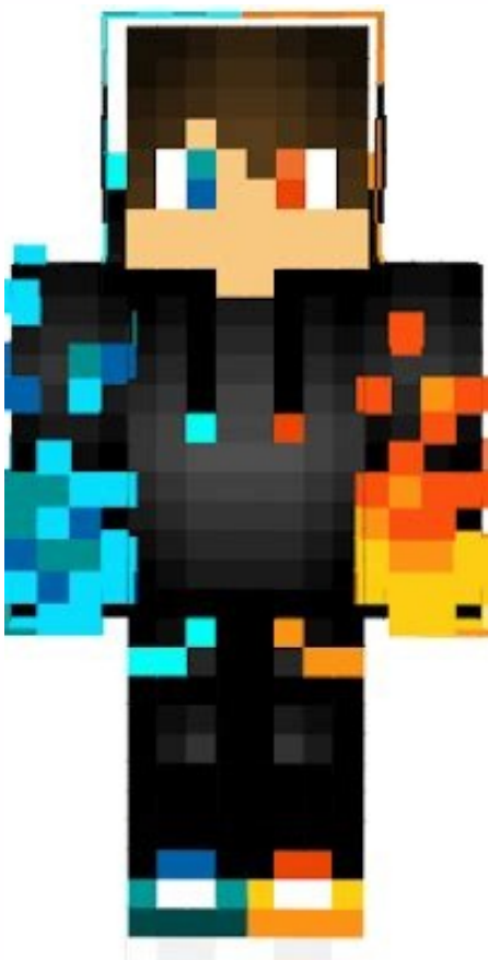
How to get hacker skin in minecraft. Download minecraft skin hacker boy. Skin de hacker boy para minecraft. Minecraft skin cool boy hacker. How to hacker in minecraft.